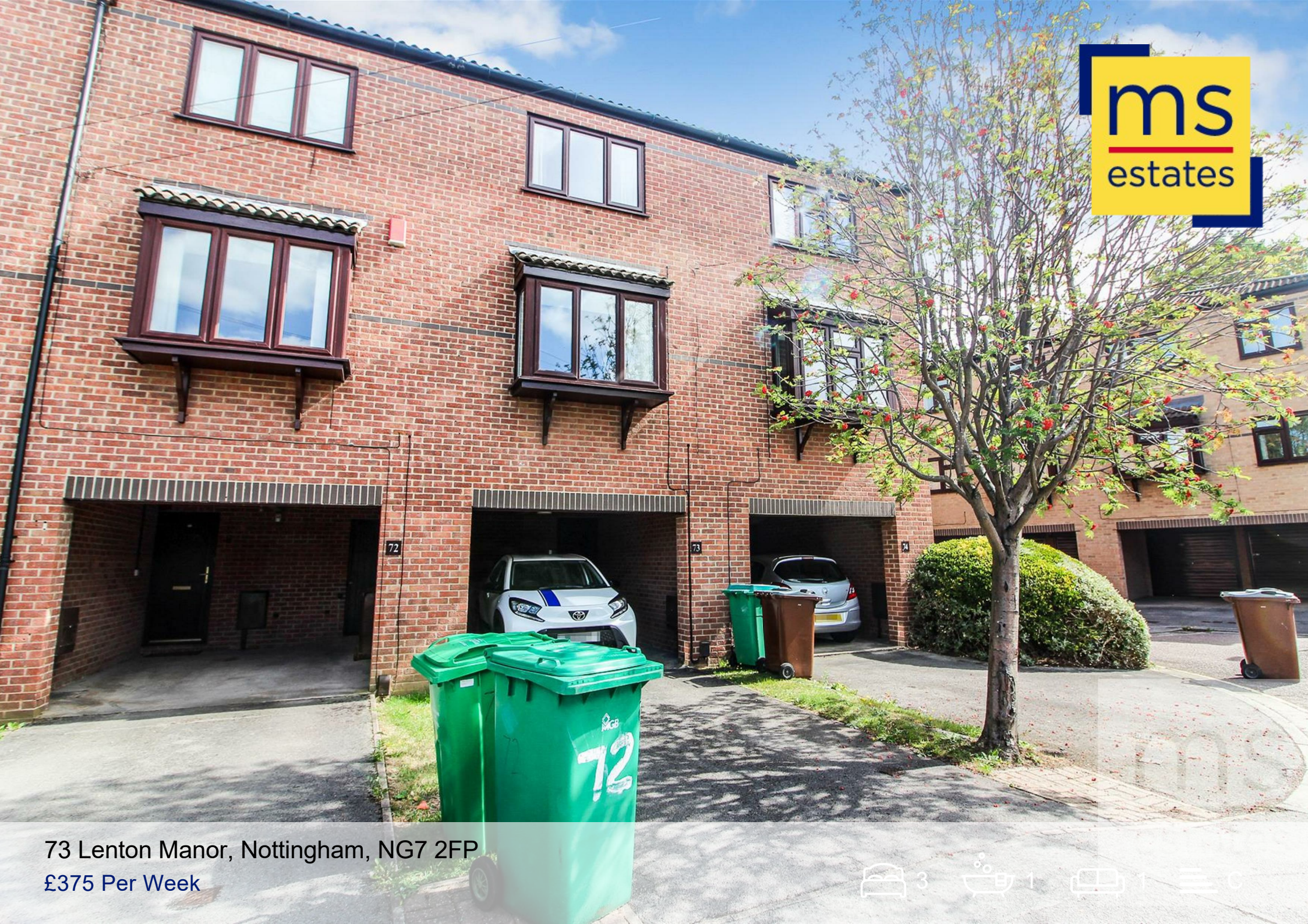
73 Lenton Manor, Nottingham, NG7 2FP £375 Per Week